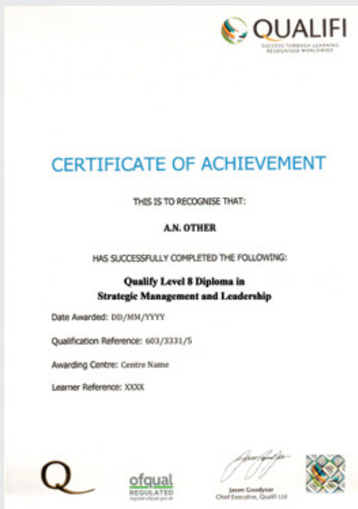
Level 8 Diploma QUALIFI,UK

You will receive the following certificates after the successful completion of the program: