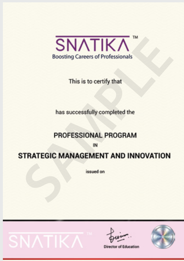
Professional Program Certificate SNATIKA

Disclaimer: The above images are for reference purposes only.