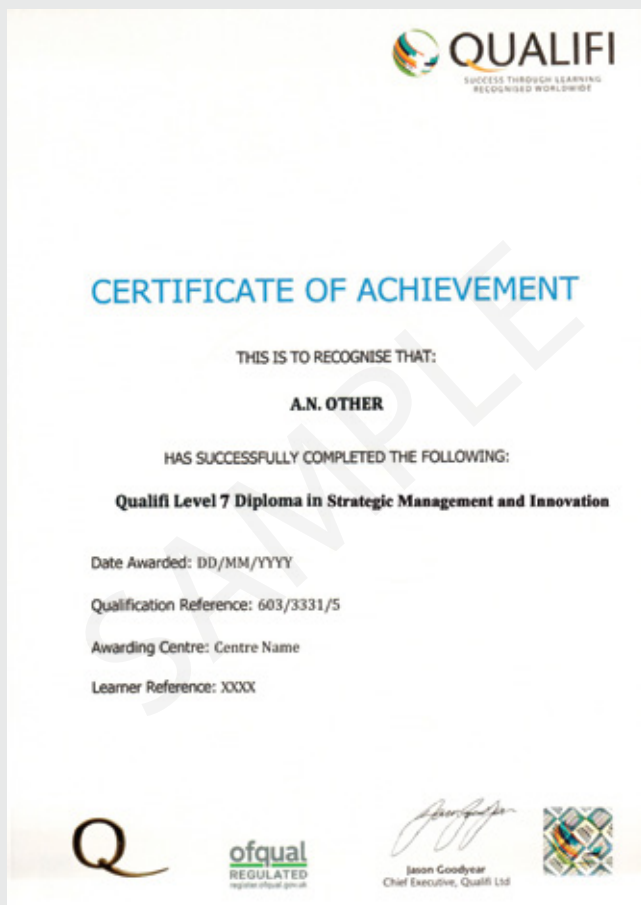
Level 7 Diploma QUALIFI, UK

You will receive the following certificates after the successful completion of the program: