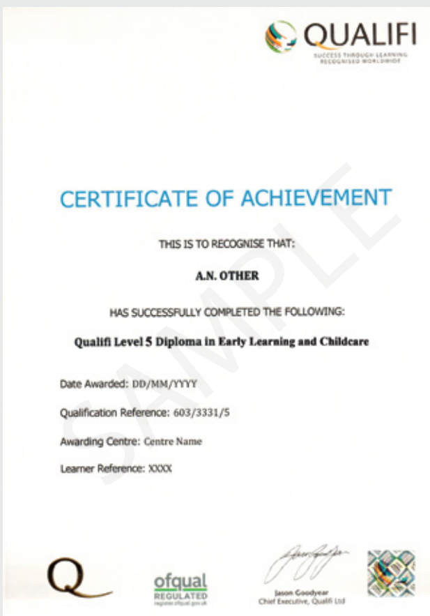
Level 5 Diploma QUALIFI, UK

You will receive the following certificates after the successful completion of the program: