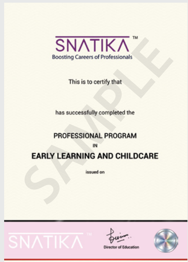
Professional Program Certificate SNATIKA

Disclaimer: The above images are for reference purposes only.