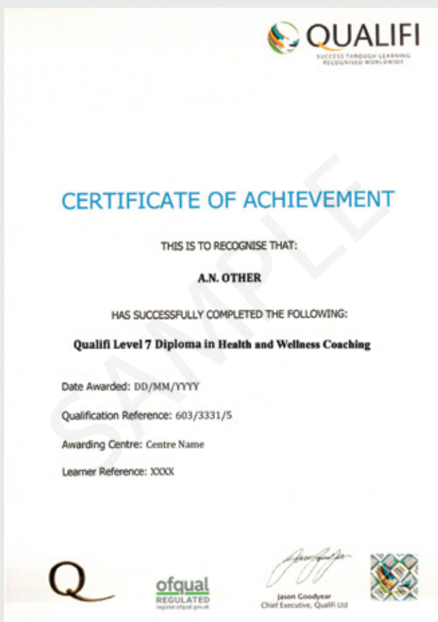
Level 7 Diploma QUALIFI, UK

You will receive the following certificates after the successful completion of the program: