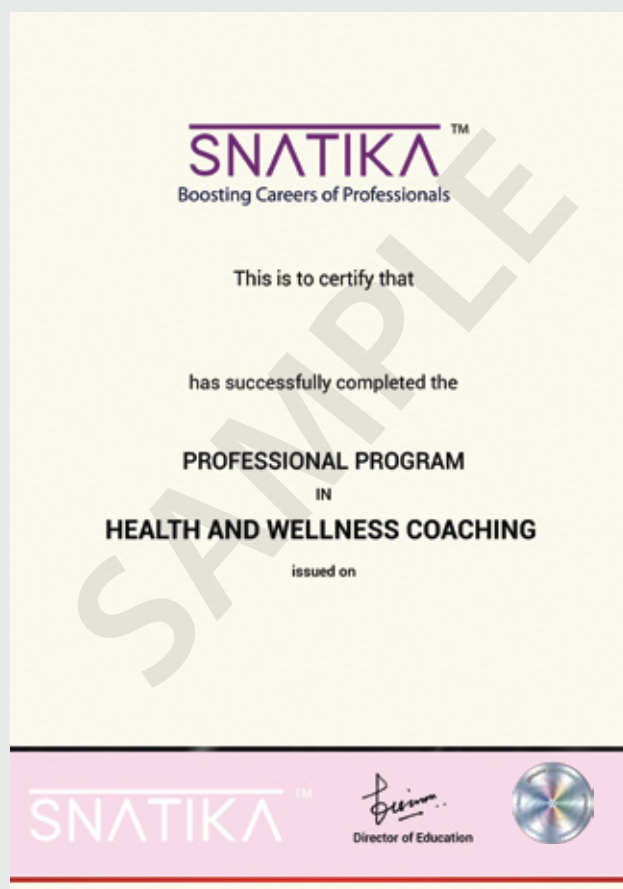
Professional Program Certificate SNATIKA

Disclaimer: The above images are for reference purposes only.