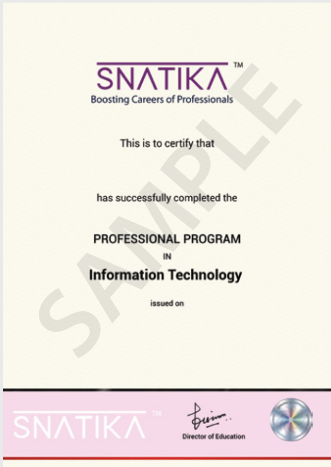
Professional Program Certificate SNATIKA

Disclaimer: The above images are for reference purposes only.