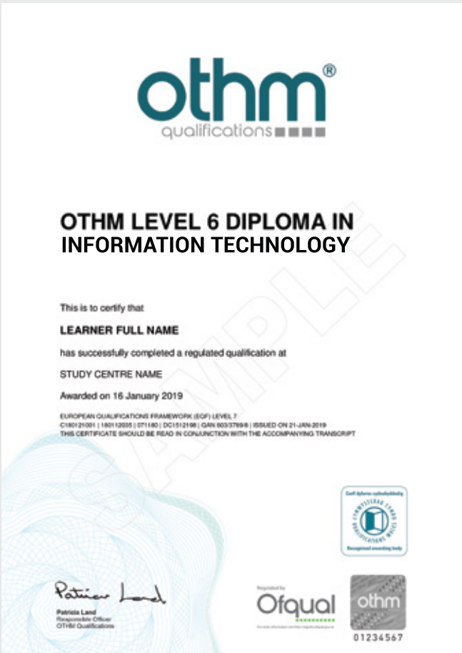
Level 6 Diploma OTHM, UK

You will receive the following certificates after the successful completion of the program: