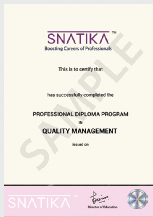
Professional Program Diploma SNATIKA

You will receive the following certificate after the successful completion of the program: