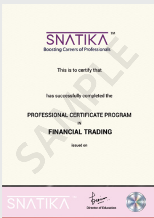
Professional Program Certificate SNATIKA

You will receive the following certificate after the successful completion of the program: