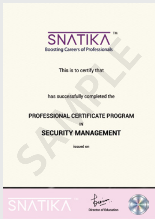
Professional Program Certificate SNATIKA

You will receive the following certificate after the successful completion of the program: