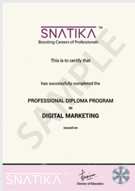
Professional Program Diploma SNATIKA

You will receive the following certificate after the successful completion of the program: