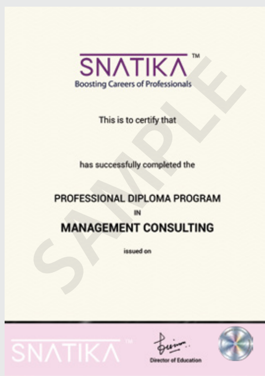
Professional Program Diploma SNATIKA

You will receive the following certificate after the successful completion of the program: