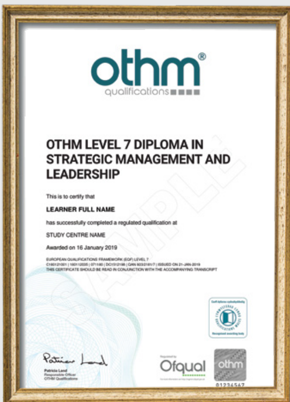
Level 7 Diploma OTHM, UK