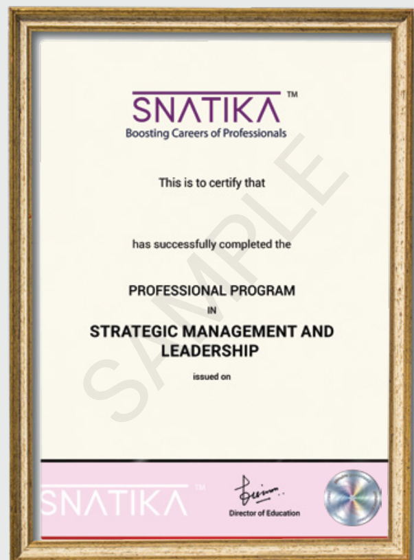
Professional Program Certificate SNATIKA

Disclaimer: The above images are for reference purposes only.