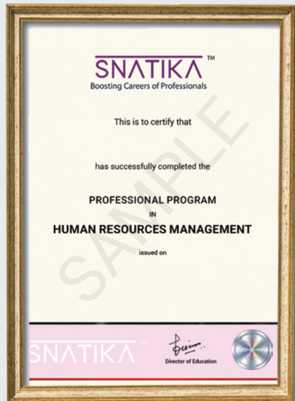
Professional Program Certificate SNATIKA

Disclaimer: The above images are for reference purposes only.