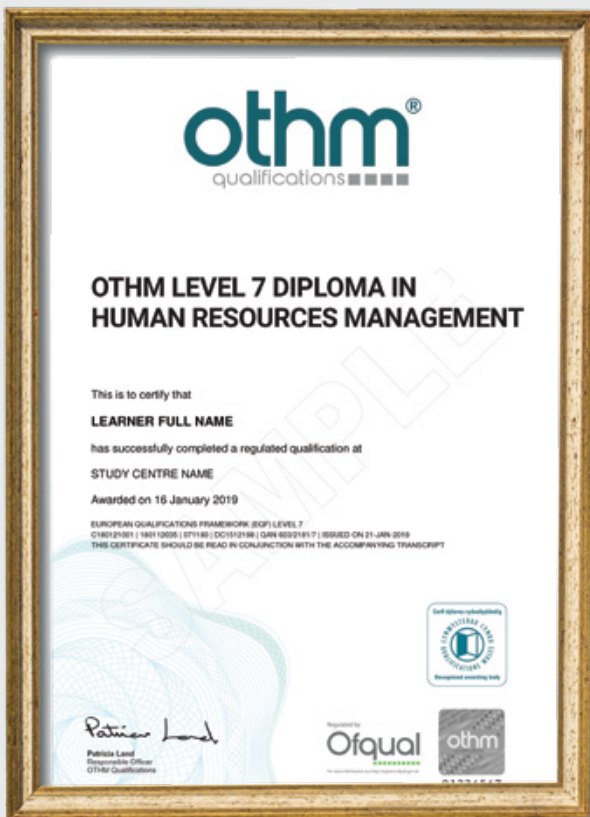
Level 7 Diploma OTHM, UK