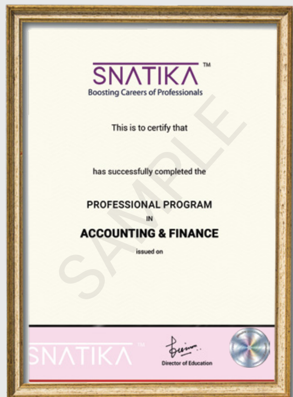
Professional Program Certificate SNATIKA

Disclaimer: The above images are for reference purposes only.