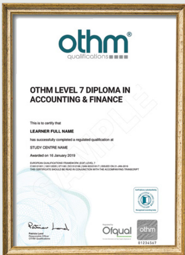
Level 7 Diploma OTHM, UK