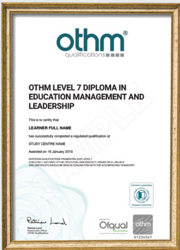
Level 7 Diploma OTHM, UK