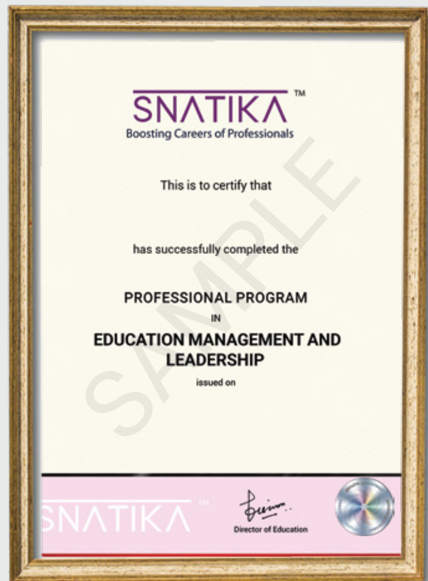
Professional Program Certificate SNATIKA

Disclaimer: The above images are for reference purposes only.