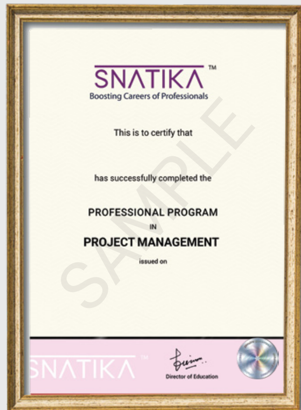
Professional Program Certificate SNATIKA

Disclaimer: The above images are for reference purposes only.