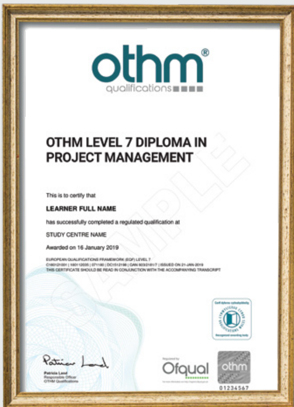
Level 7 Diploma OTHM, UK