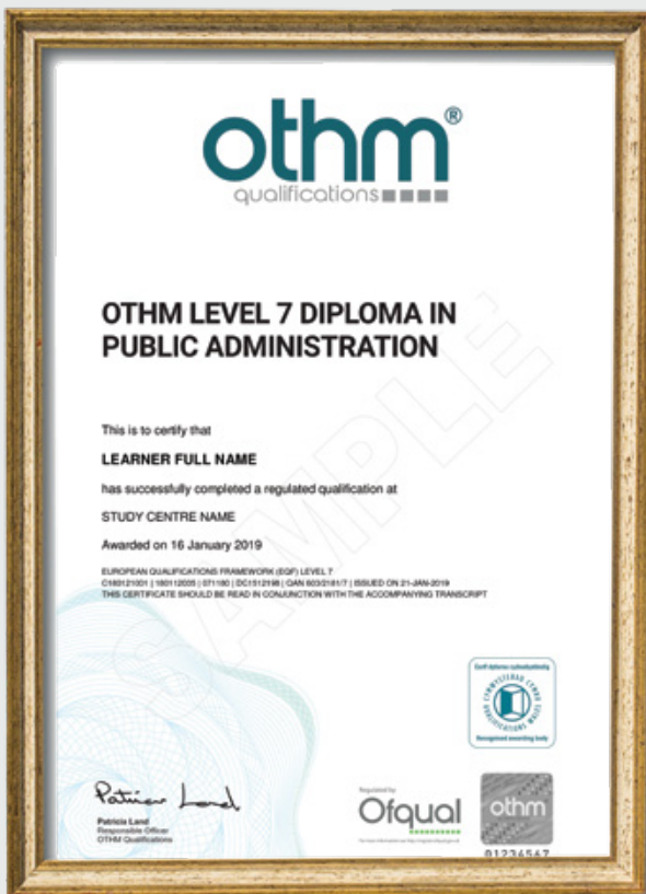
Level 7 Diploma OTHM, UK