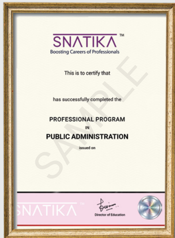
Professional Program Certificate SNATIKA

Disclaimer: The above images are for reference purposes only.