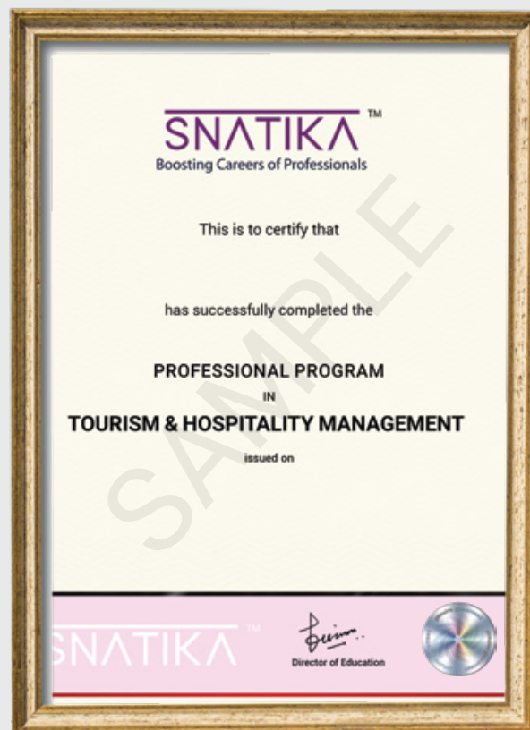
Professional Program Certificate SNATIKA

Disclaimer: The above images are for reference purposes only.