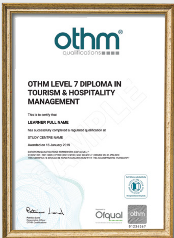
Level 7 Diploma OTHM, UK