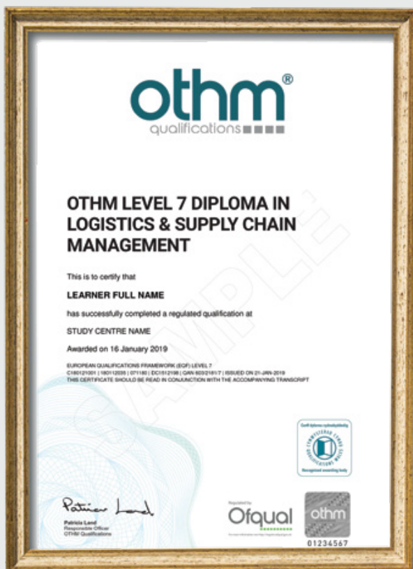
Level 7 Diploma OTHM, UK