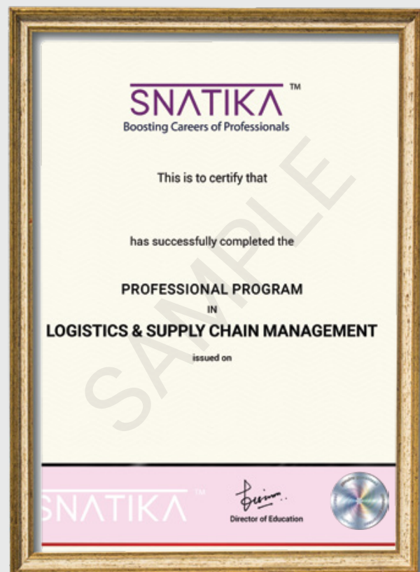
Professional Program Certificate SNATIKA

Disclaimer: The above images are for reference purposes only.