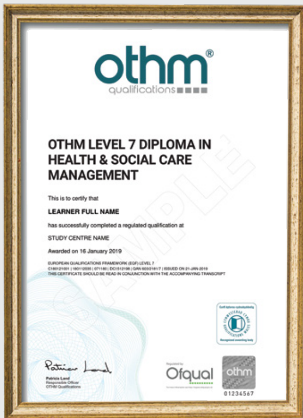
Level 7 Diploma OTHM, UK