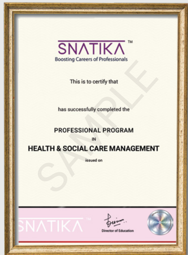
Professional Program Certificate SNATIKA

Disclaimer: The above images are for reference purposes only.