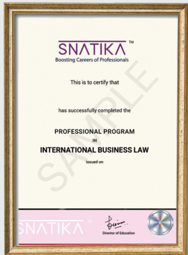
Professional Program Certificate SNATIKA

Disclaimer: The above images are for reference purposes only.