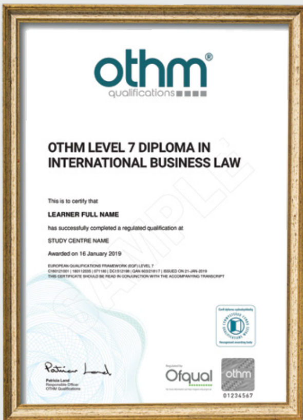
Level 7 Diploma OTHM, UK